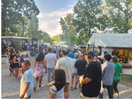
Just a “few” people stopping by for the Sweet Corn Festival