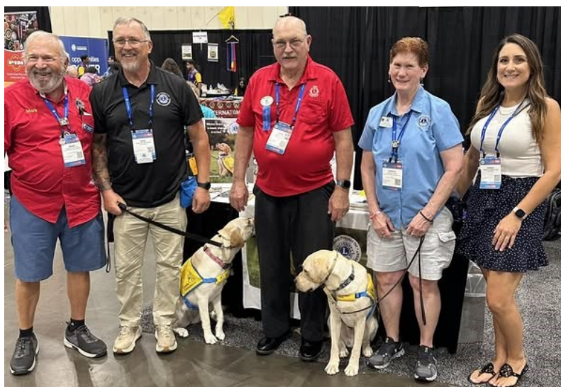
Now that's a great looking group! Our Trustees have gathered from all over the country to represent our foundation this week at the #LionsCon2025!