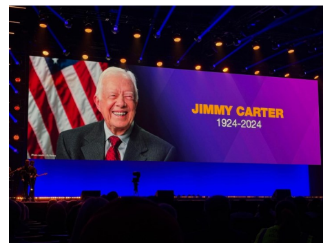
A tribute was given to President Jimmy Carter.