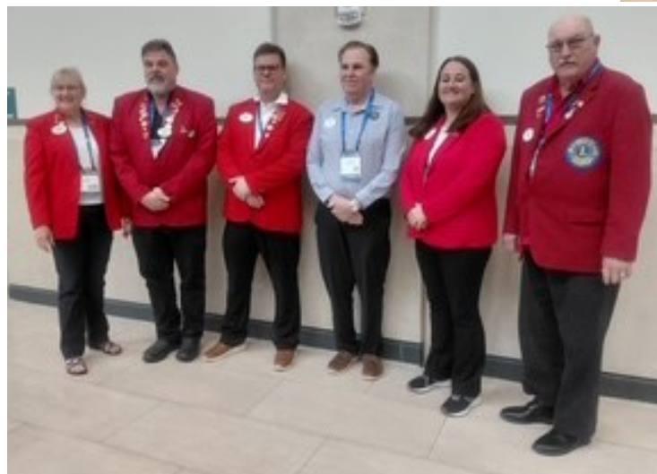
NEW OHIO DISTRICT GOVERNORS 2025-2026