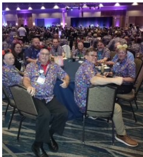
Ohio's new District Governor's celebrating together after their training finished in Orlando.