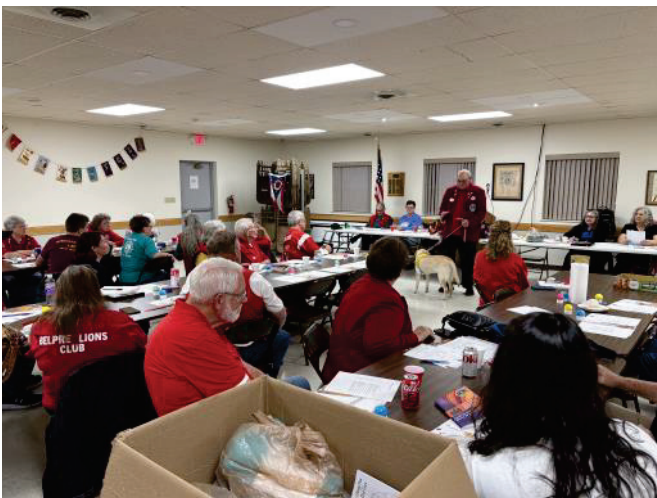
Our Club hosted the Zone 6 meeting with about 33 were present.