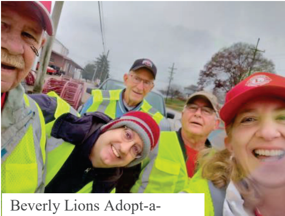
Beverly Lions Adopt-a-highway clean up.

The Club presented gas card from OLPCF to the family of a patient.