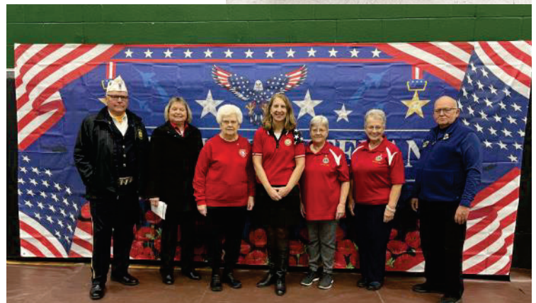
Lions and American Legion attended three school Veteran's Day assemblies.