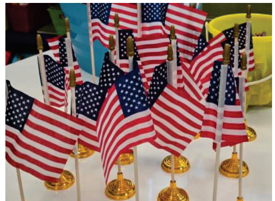
Each First Grader received their own flag to take home.