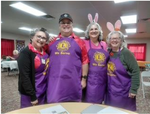
Lots of “bunny” helpers at the Millersport Lions Club Easter Breakfast and Egg hunt!