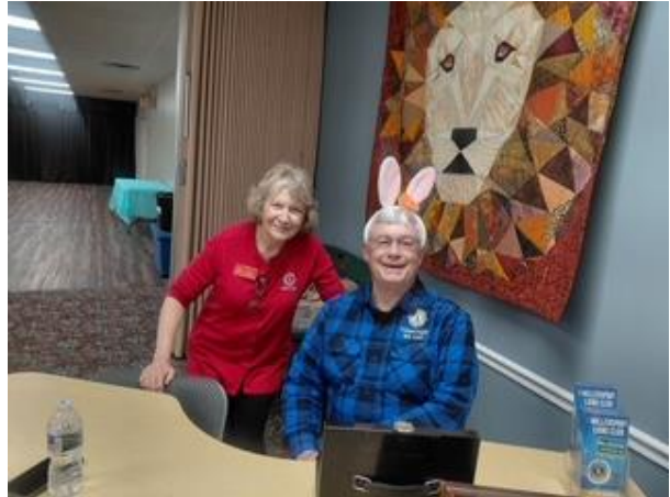
Find the eggs,, they are everywhere!