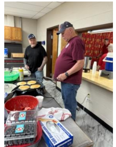
Pancake Breakfast with the Easter Bunny was a success!