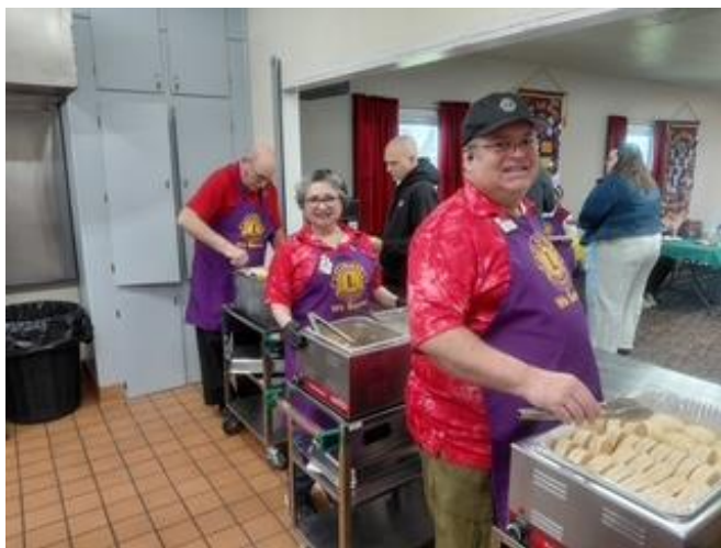
Kitchen helpers are hopping to get the breakfast ready to feed the little peeps!