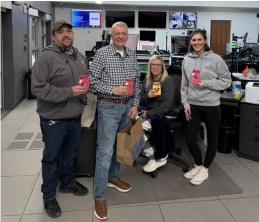
The Athens County Sheriff's Office,