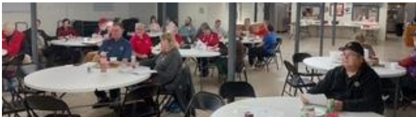
Zone 5 Meeting tonight hosted by Pleasantville Lions Club