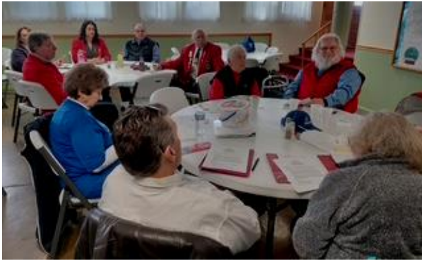
PDG meeting at cabinet meeting.