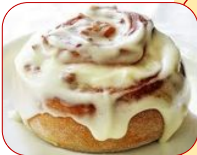
813 - the number of calories in a classic Cinnabon roll