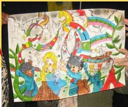
2nd Place Winning Poster