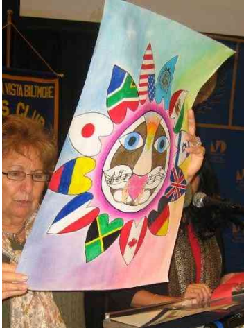
1st Place Winning Poster