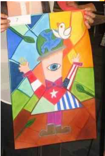
3rd Place Winning Poster

taries from District 35N, who were treated to refreshments and sandwiches during the deliberation period.