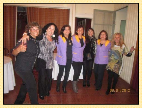
Also at the Italian Dinner with the Comite de Damas Leones de Rancagua.