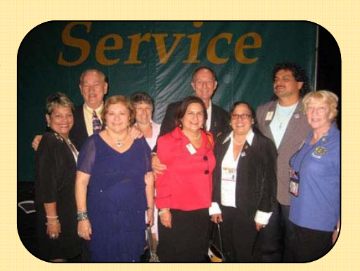
Love this picture because it says it all...3 PDGs and above everyone's head— "SERVICE."