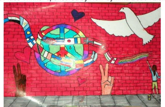
2<sup>nd</sup> Place Winner sponsored by Palm Coast Lions

DISTRICT 35-O PEACE POSTER CONTEST WINNERS