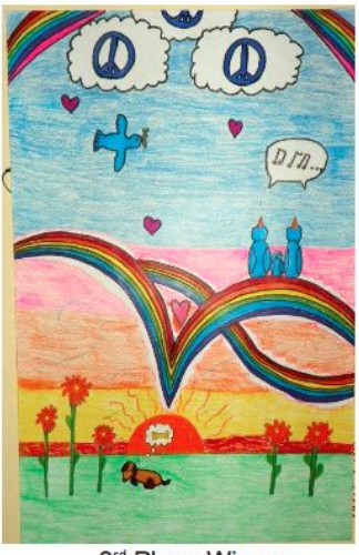
3<sup>rd</sup> Place Winner sponsored by Viera Lions

DISTRICT 35-O PEACE POSTER CONTEST WINNERS