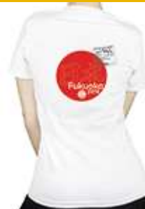
Fukuoka Ladies' T-Shirt US$14.95