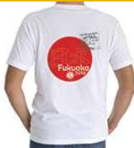
Fukuoka Men's T-Shirt US$14.95