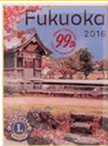
Fukuoka Pin US$7.00

Order your souvenir pin, tab, and banner in advance! No need to wait in line at the Lions Store, and no risk of selling out!