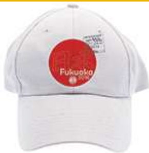
Fukuoka Cap US$14.95

Order your Fukuoka apparel now and have it ready to pack before you leave!