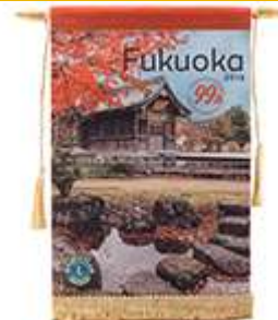
Fukuoka Banner US$13.00

Find these items in our online LCI Store and look for even more commemorative items in Fukuoka!