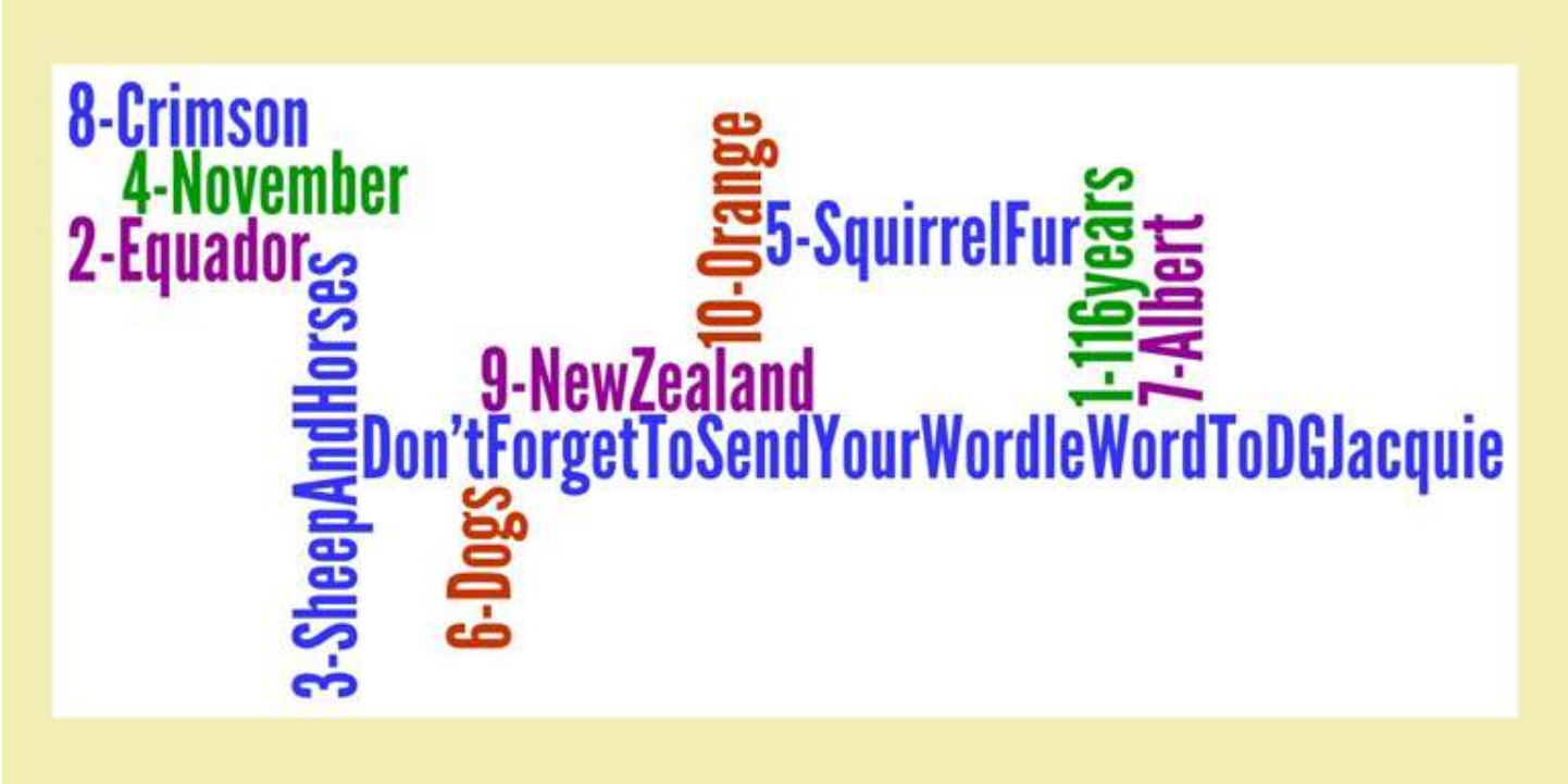
This is a small "wordle". The one for District 35-O is expected to include 50 or more words. Wow!