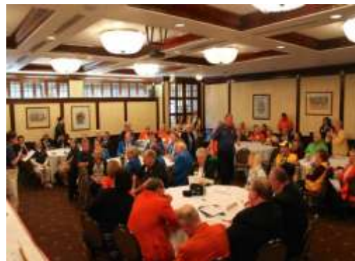
At the Ocala Hilton