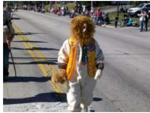
Inverness Lions Club