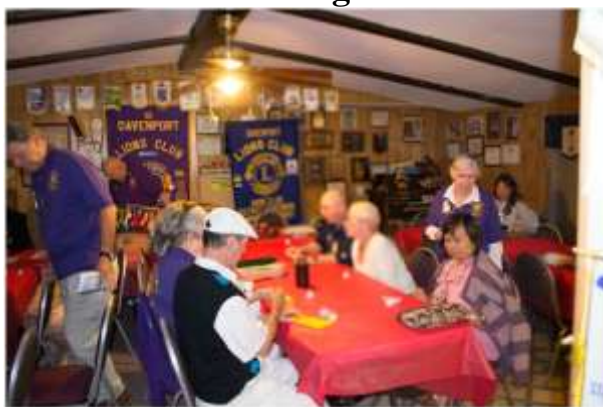
Davenport Lions Club