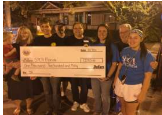
Lakeland Lions Club donating to the SPCA.