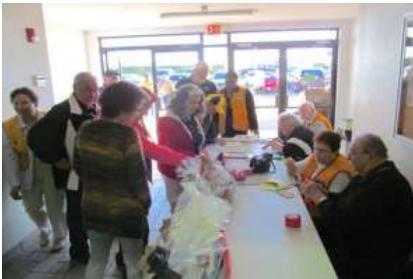
Lions checking out the raffle prizes at the cabinet meeting