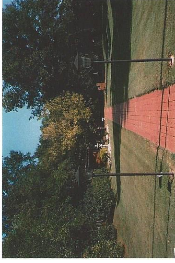
Knights of the Blind Walk Lions Memorial Garden Tuscumbia, Alabama