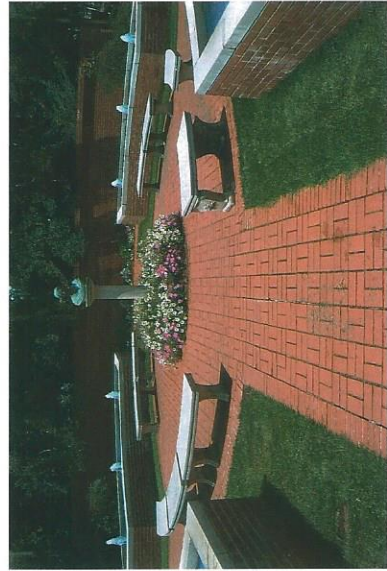
Alabama Lions Fountain at Ivy Green

The Lions invite everyone to join with them in the building of the walkway as a tribute to the sightless.