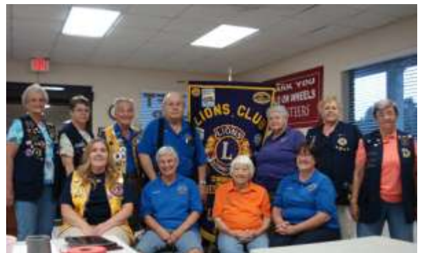
Cypress Gardens Lions getting ready for the new year