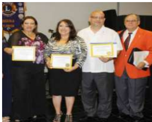
Osceola Latin America Lions