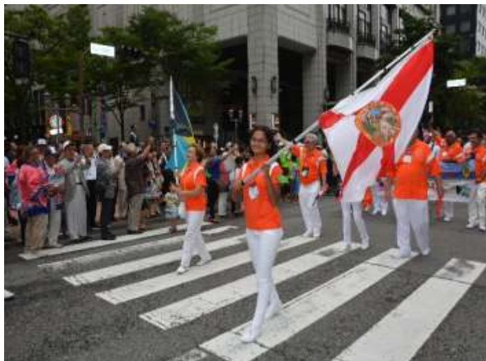
DG Steve's Daughter carrying the flag at the International Convention in Japan