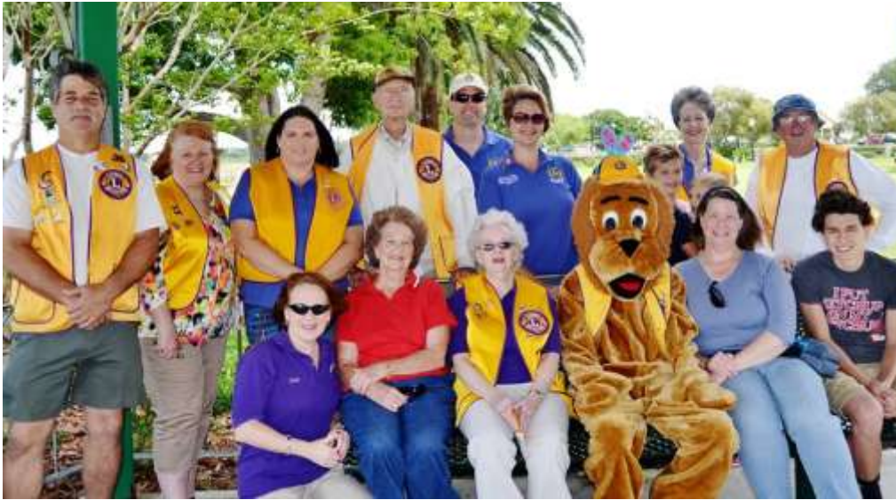
Winter Garden Lions Club getting ready for the 2015 Easter Egg Hunt

* Find More Pictures on our FACEBOOK Page: Florida Lions District 350