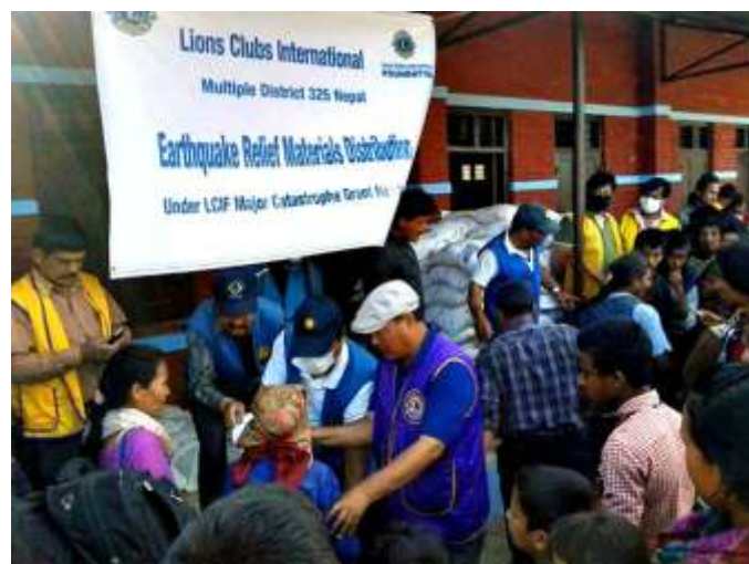
Photo: LCIF Earthquake Relief in Nepal. To view additional photos go to the LCIF link (Click Here) or the link to photos provided by the Kathmandu Lions Club (Click here) .

In the wake of the 7.9 magnitude earthquake in Nepal, LCIF has awarded a US$100,000 Major Catastrophe grant. Local Lions are already hard at work providing disaster relief in the affected areas. Our thoughts and prayers go out to the victims,