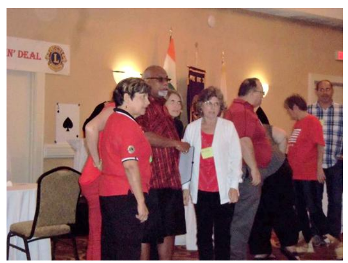
District 0 Team playing a game at Game Night.