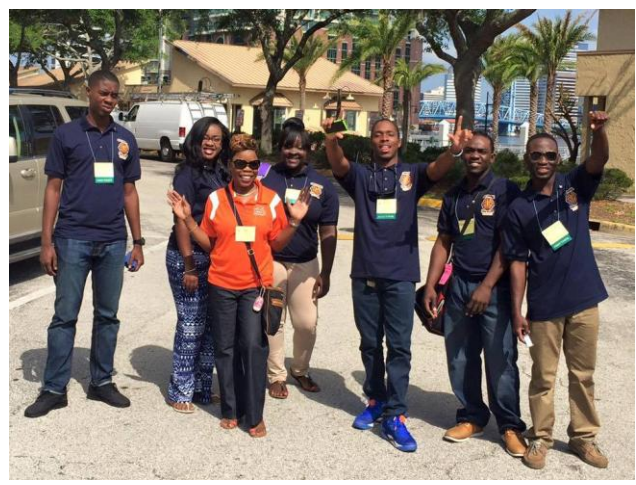
Freeport Lions and LEO's at the Multiple District 35 convention in Jacksonville, FL