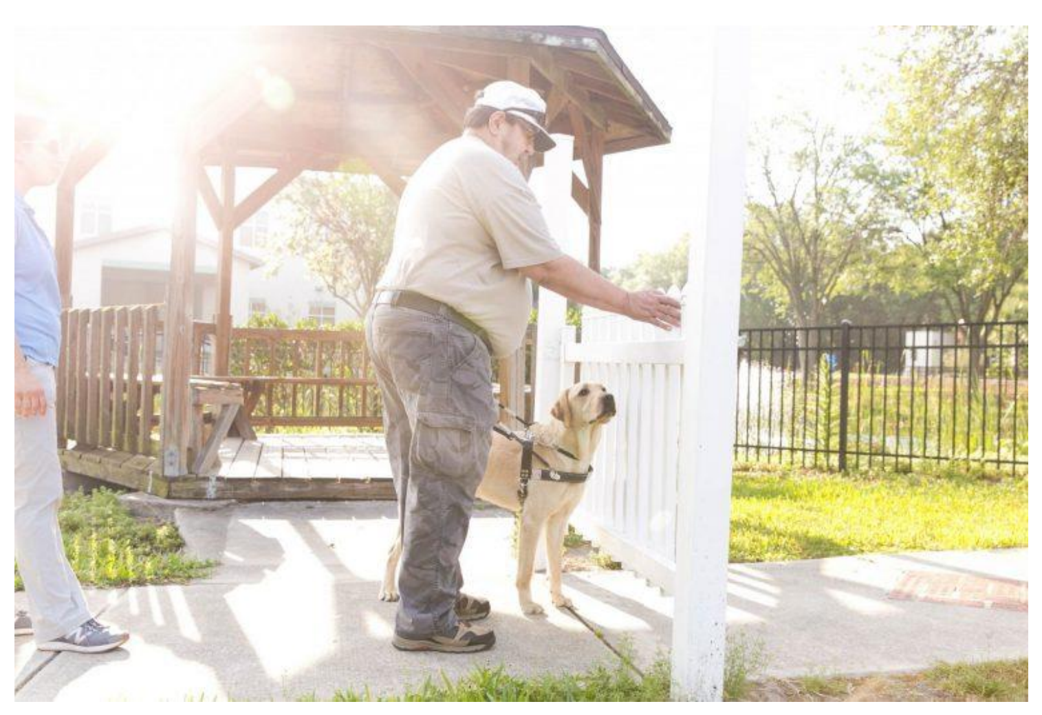
Our dogs are trained to stop when there is an obstacle in front of the team. The command "forward around" is used to guide the team around the obstacle. [Pictured: an older man finds a gate with his hand after his yellow Lab alerts him to the obstacle.]

When it comes to the specific commands that our dogs learn here at Southeastern Guide Dogs, they differ depending on whether the dog is training as a service dog for a veteran or as a guide dog for a person with vision loss. These two categories of individuals need different tasks. Today we will learn guide dog commands, and in a later post, we'll learn about service dog commands.