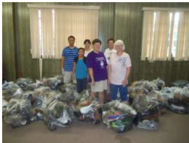
Photo is of Ormond By The Sea Lions Club Members standing in 41 bags of wrapped shoes.