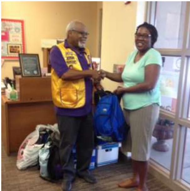
Kissimmee Lions club donated school supplies to Central Ave Elementary School