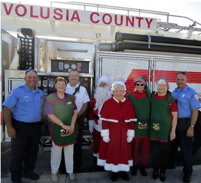
Volusia County Firefighters, Ormond By the Sea Lions Club Elves and Santa and Mrs. Claus at Breakfast with Santa

December 16 had Club members taking two hour shifts to ring the bell for the Salvation Army In front of the Publix in the Ormond Mall. 2018 is going to be just as busy! Join us to help your community.