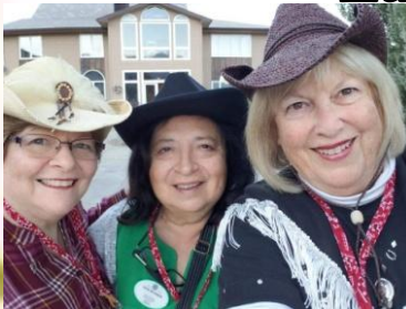
Cowgirls ready to party!