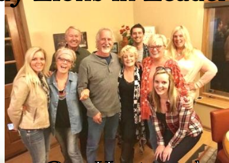
Our Hosts and our Chefs