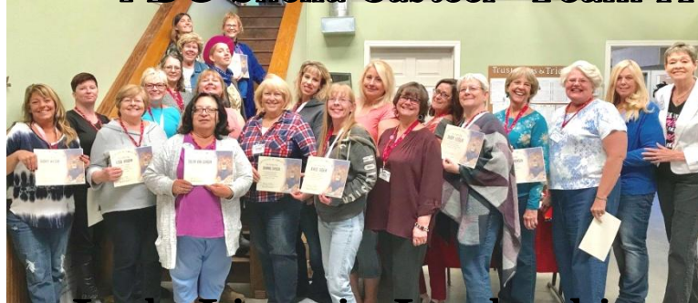
Lady Lions in Leadership