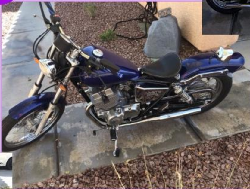
'86 Honda Rebel CMX250