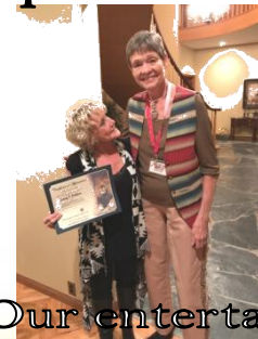
Our entertainer Lacy J. Dalton