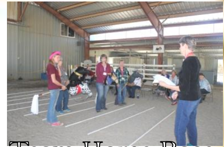
Team Horse Race