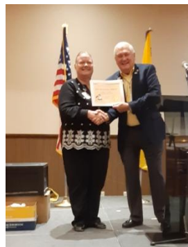
International Certificates of Appreciation