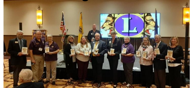
IPDG Barbies Heart of the Lion Awards