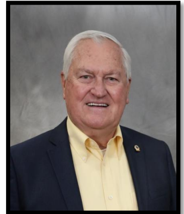
Governor Vern Watts