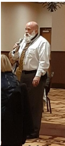
The Voice of Adam!