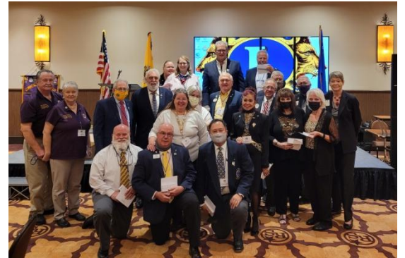
IPDG Barbies Best Darn Cabinet Awards