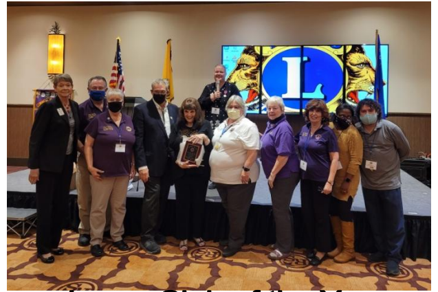
Large Club of the Year Las Vegas Summerlin