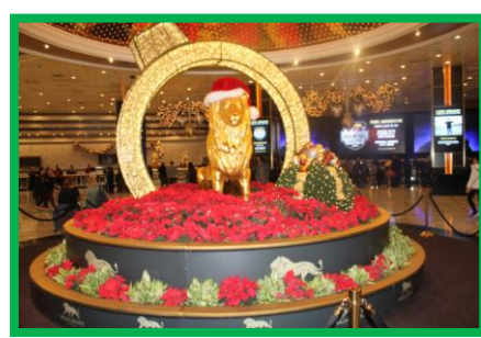
MGM Grand Holiday Lion

Advanced Lions Leadership Institutes focus on building the skills of Lions leaders to prepare them for leadership responsibilities at zone, region and district levels.