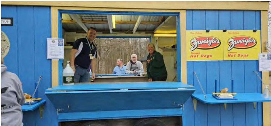
Not a great view of the eclipse but it was still a fun experience.