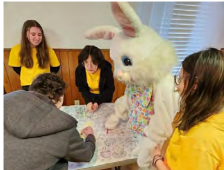
The Easter Bunny and the Leos are helping some parents color the table top.