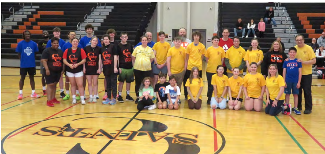
The Unified Teams vs The Leos

The annual Leo Club March Mayhem benefit basketball game was held on Saturday March 9th at the Churchville-Chili Middle School. The benefit was played for the Willie Bee Foundation, a not-for-profit charitable organization founded in August 2017 to benefit local families who have a child facing a life-threatening illness. After all the mayhem, smiles and excitement, with the help of the LEO Club members, Churchville Lions Club staff and community support, the total amount raised was $1090.