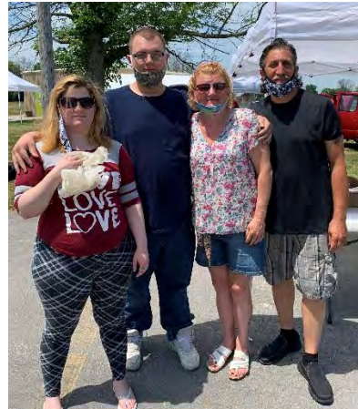
The Shurbert Family