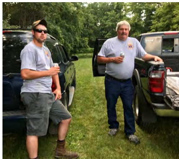
Taking a break