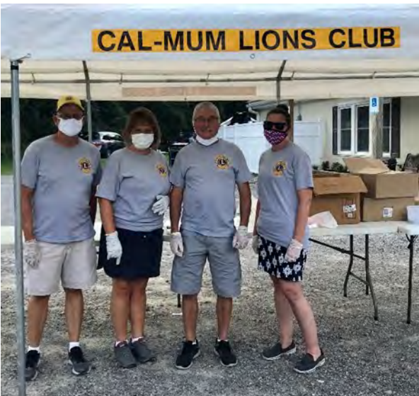
Greeted by covered smiling faces

The Cal-Mum Lions had a successful drive-thru Fundraiser on August 8. They served 200 dinners. It was their first time doing it. They had an efficient team doing the work.