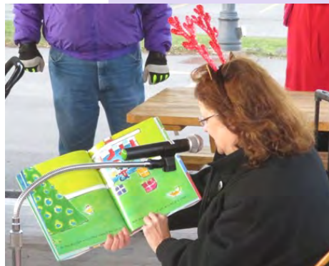
The Village Librarian reads a story to the children.

The Holiday Tree Lighting Ceremony was held on a cold breezy December 4th complete with stories, carols, cookies, candy and Santa to guarantee a fun event. The Village Mayor and Town Supervisor welcomed the assembly to the new outdoor Village Pavilion and began the festivities with storytelling from the Village Librarian followed by a sing-along of our favorite Holiday Carols. Santa arrived in his Fire Truck Sleigh and assisted in lighting the Holiday Tree in the Village Gazebo, then chatted with the children about their wish lists. The Lions Club handed out treats and coloring books before Santa headed back to the North Pole.