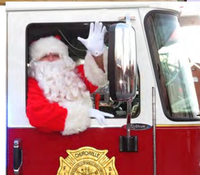
Santa gives a big wave goodbye to all the boys and girls.