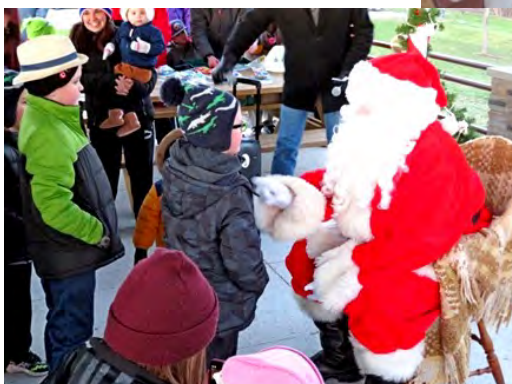
Children wait to chat with Santa.