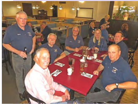
Some of the guests from the Brockport Club