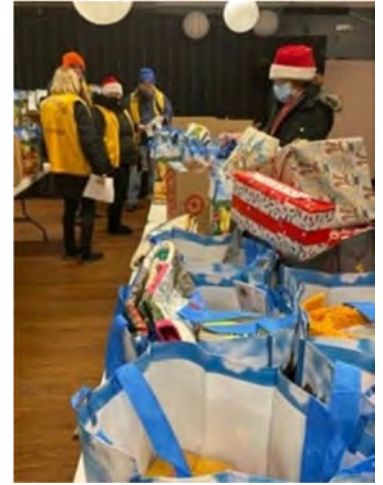
Food, Toys, and extras

Chili spent lots and lots of quality/socially distanced time together as they collected, sorted, filled boxes and bags, loaded vehicles, and delivered 30+ holiday/food baskets to families in Chili.