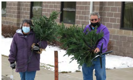
Christmas Trees to be Given Out