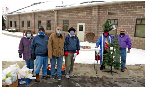
The Churchville Lions