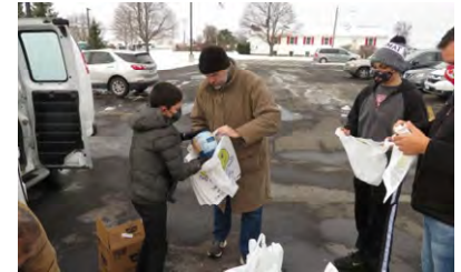
Boy Scouts Bag a Chicken & Fruit