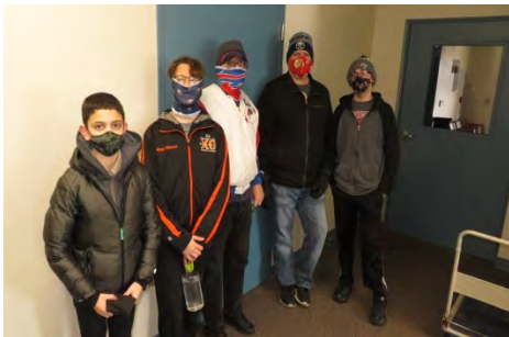
Boy Scout Troup 133 warming up