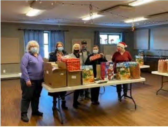
Lots of Helpers