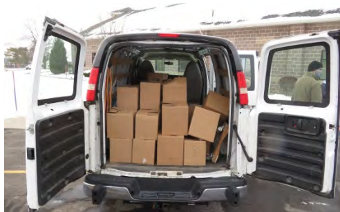
Lion Buzz's Van Packed w Food Boxes