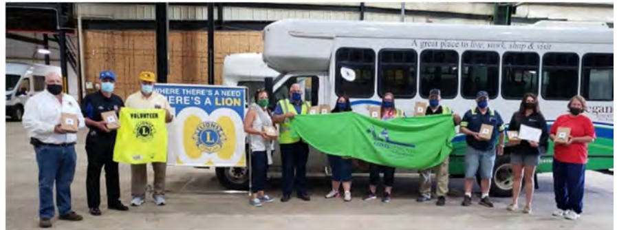
On Wednesday, June 24 th the Lions of District 20-E1 provided 25 lunches for the employees of the Allegany County Transit Service.