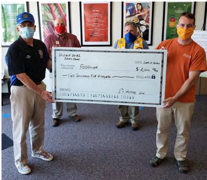
The District presented a check for $2,500.00 on June 17 to FoodLink for their backpack program. Children in our area receive free or reduced-price lunch at school. But when school is closed during weekends and holidays, many of those children go hungry. FoodLink's Backpack Program provides children in need with bags of nutritious food they can discreetly take home and easily prepare on their own. The bags typically weigh about five pounds and contain items from all the food groups. A big thank you to the Brandel-Murphy Youth Foundation for this grant.