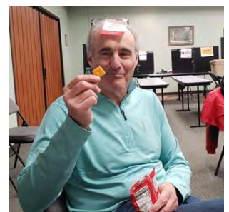
Lion Al needs snacks.