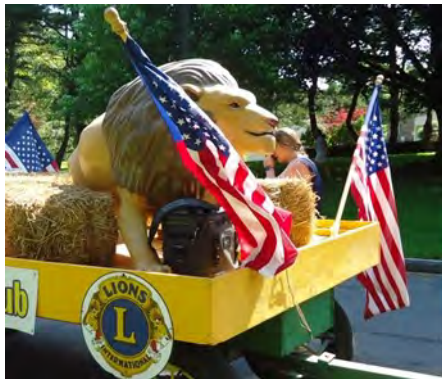
Lion Float ready for riders