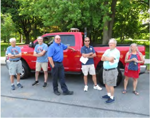
A group photo before the parade