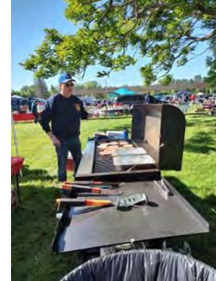
Preparing for the Chicken BBQ