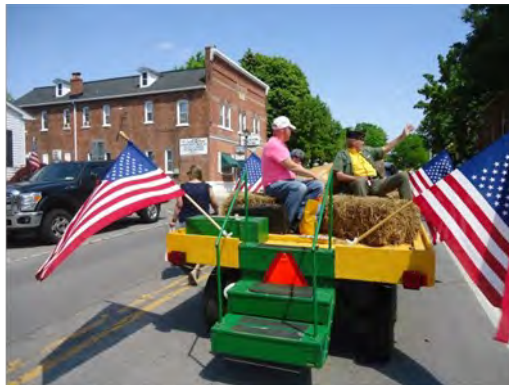
The Lion Float heads north on Main St.