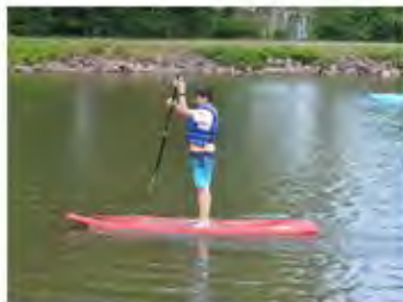
Stand Up Paddle Boarding

A week-long educational summer sports camp for children who are blind, visually impaired, and deafblind!