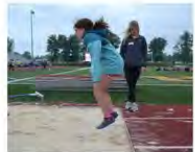
Track & Field

Plus: Blind Soccer, Blind Tennis, Swimming, Roller Blading, Kayaking, and more!