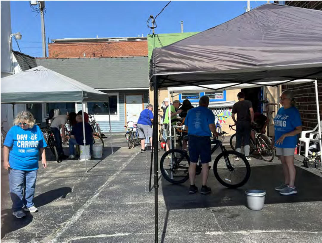
Batavia Lions and students from GCBOCES repairing bikes for Day Of Caring 2024.