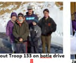
Scout Troop 133 on bottle drive