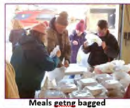
Meals getng bagged