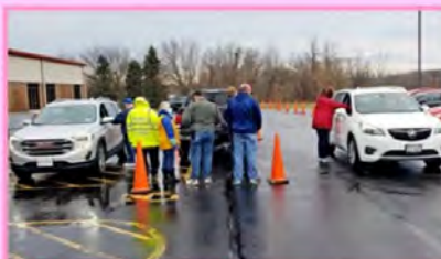
Two drive-thru lines were set up.