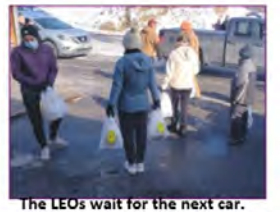
The LEOs wait for the next car.