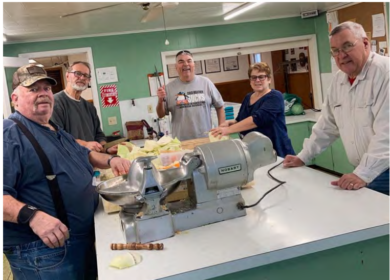
Kendall Lions prepare the cabbage salad for the chicken BBQ.