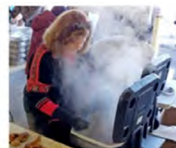
Lion Barb with steamy chicken