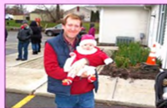
Villager with a baby Santa