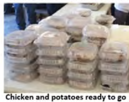
Chicken and potatoes ready to go