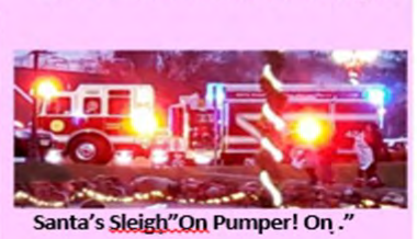
Santa's Sleigh "On Pumper! On."