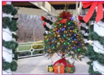
Tree lighting in the Gazebo