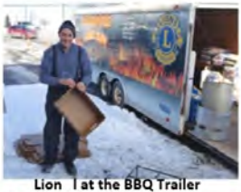
Lion I at the BBQ Trailer