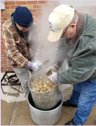
50 pounds of potatoes cooked and ready for distribution