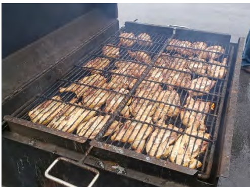
The first batch of chicken is almost ready.