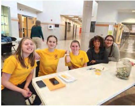
The LEO Club collected donations at the Gym entrance.