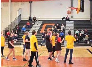
Two points for the LEOs