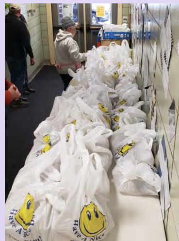
The completed meals are staged for the next hungry customer.

The Churchville Lions WinterFest Barbecue in partnership with Riga Recreation was held at Churchville Elementary School on January 29 th . Six hundred and fifty chicken dinners were packaged and bagged in near record time with two assembly lines as LEO Club runners hustled meals out the door and into waiting cars. The Lions are grateful to the volunteers and for the generous support from the community in making the event a huge success.