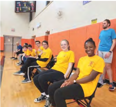
The LEO team is ready for some basketball!