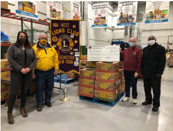
$8,000 check presented to Foodlink from Rochester Downtown Host Lions 2/19/21