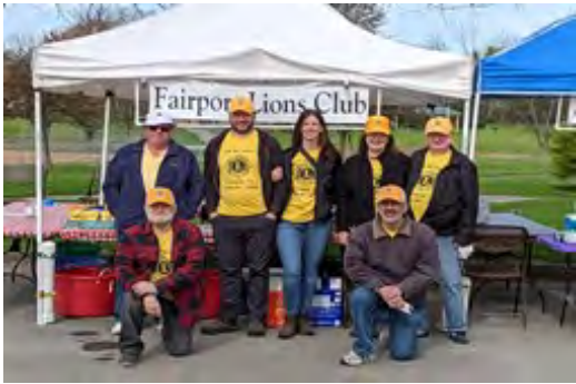
Lions ready to serve food & drinks