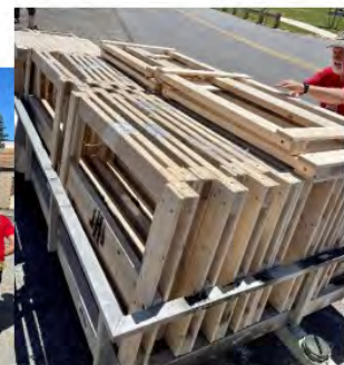
Ready for Delivery