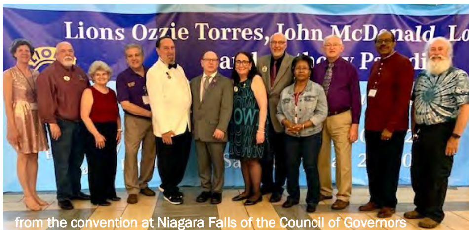
from the convention at Niagara Falls of the Council of Governors