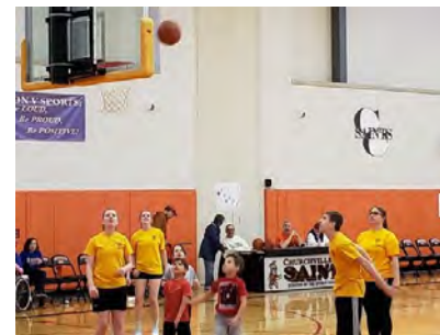
LEOs get 2 points.