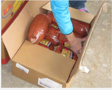
Fresh 5-pound hams.