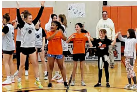
Y—M—C—A between periods