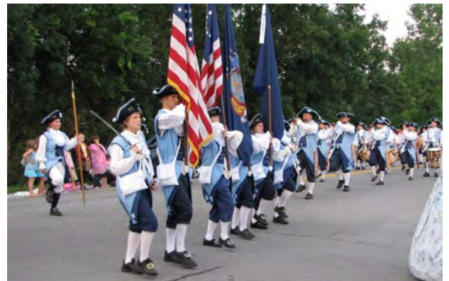
Our next event will be The Festival In The Park. It is a two day Festival held on July 22 and 23 in Ginegaw Park. Shown in the photo are the Tow Path Volunteers, a favorite of the spectators.