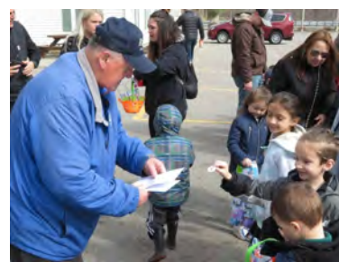
A Golden Egg winner gets a prize.