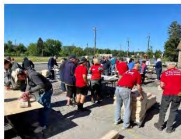
This was the 1 st shift; 2 nd shift was even bigger.