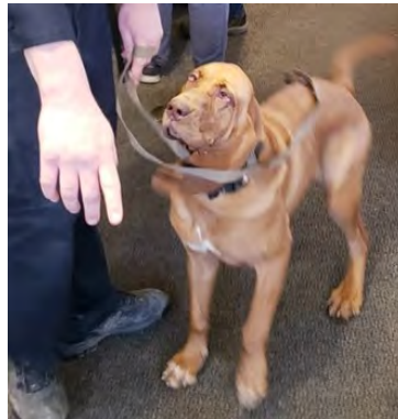
Peak holds the scent for 6 hours before it slowly fades.