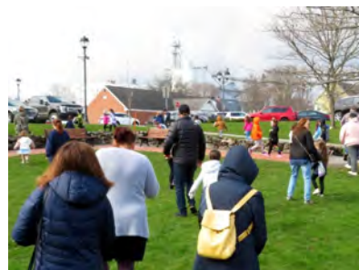
The kids scatter trying to find the Golden Egg to win a prize.