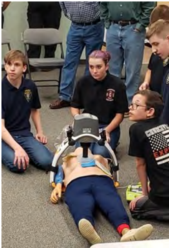
The Churchville Explorers demonstrated the workings of the mechanical compressions performed by the LUCAS device.