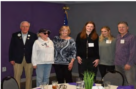
Barret Family being introduced