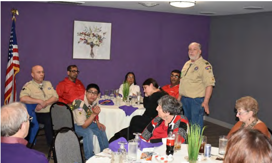
Dinner Meeting April 4 with the Boy Scouts:

Scout Master going over the current projects