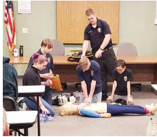
In a simulation of a real time emergency where seconds count, the Churchville Explorers first demonstrated manual CPR compression to allow time to ready the LUCAS device.