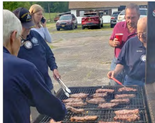
Steaks are grilled to perfection.