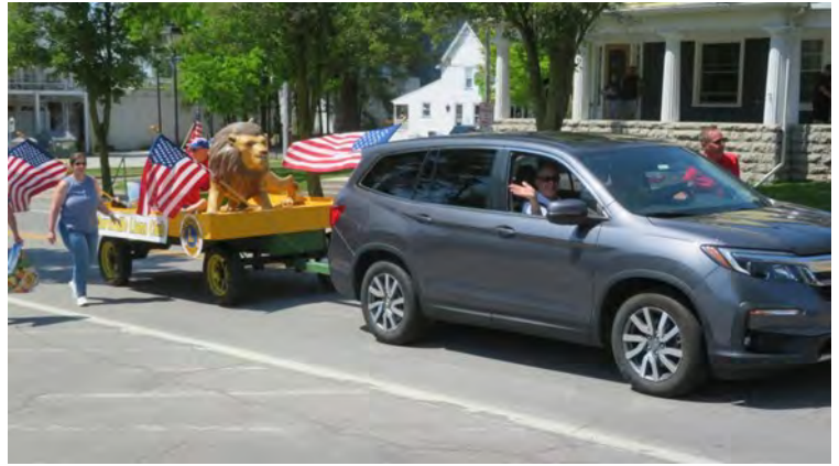
The Lions Float heads up Main Street in Churchville.