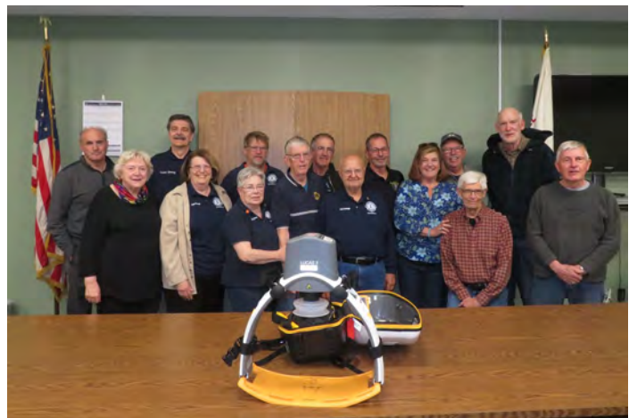
The Churchville Lions pose as backdrop to the new Lucas 3 device.