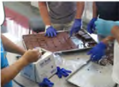
Cutting and wrapping the brownies