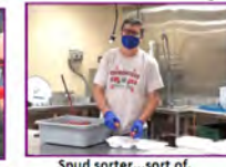
Spud sorter...sort of.