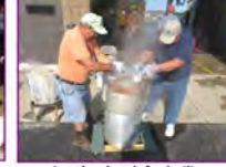
Another batch for boiling