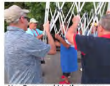
Lion Buzz caught in the canopy