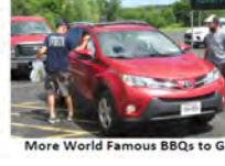
More World Famous BBQs to Go