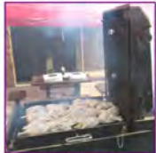
Just a few but there's more!