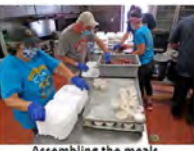
Assembling the meals.