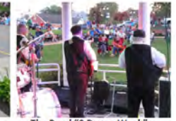
The Band "8 Days a Week"