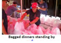
Bagged dinners standing by