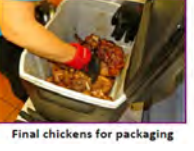
Final chickens for packaging