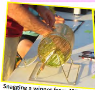
Snagging a winner from 427 tickets