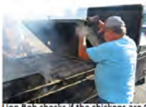
Lion Bob checks if the chickens are OK.