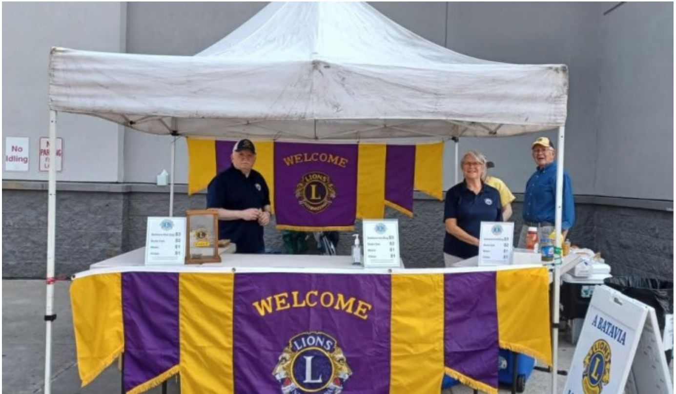
Batavia Lions selling hot dogs at Walmart