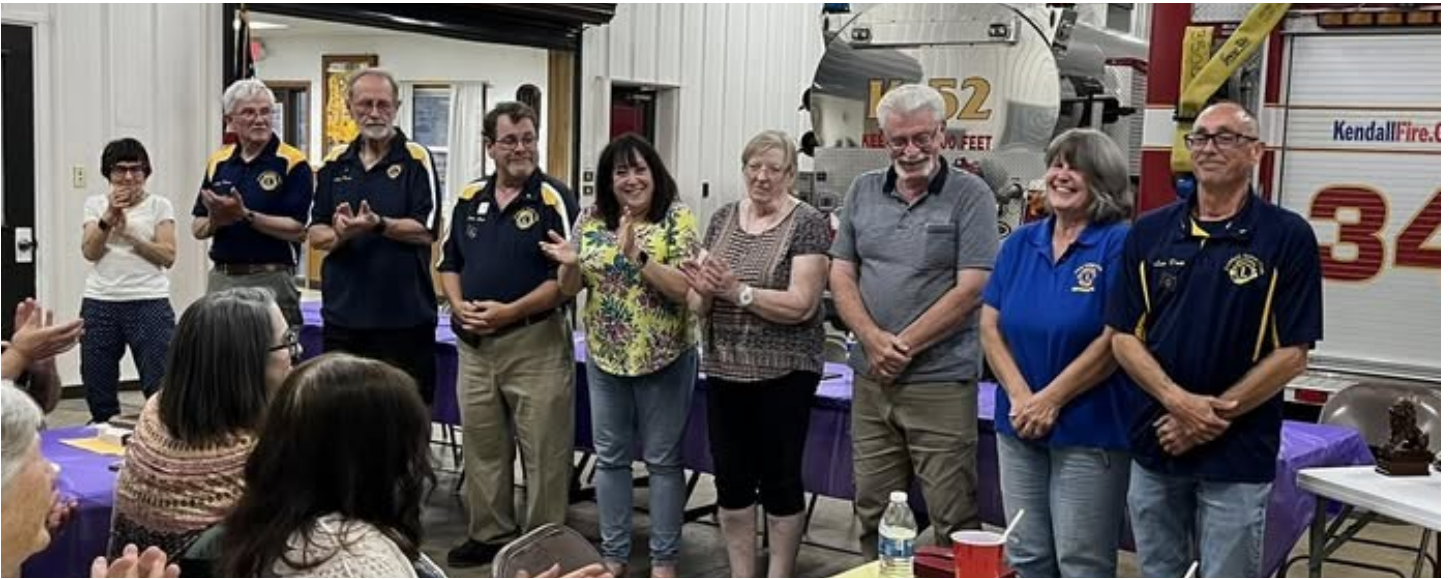
The Kendall Lions installed their officers for the 25-26 Lion year at our Installation and Awards Dinner in June.