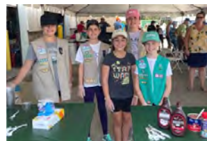
Ice Cream Team and all the toppings.