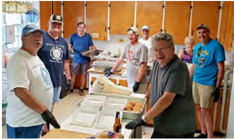
The kitchen cooking team of Legion and Lions preparing pulled pork dinners.

The June 16th Walk-about in Churchville allowed merchants and vendors to display and promote their wares and services. It was also a great chance to socialize with friends and neighbors in the community.