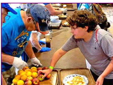
Fresh fruit for a camper