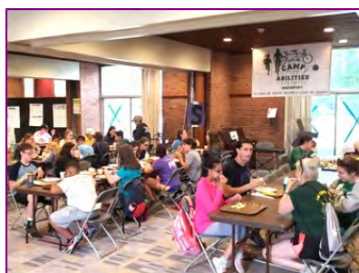
Campers enjoying their meals.

Camp Abilities Brockport is a one-week educational sports camp for children and teens who are blind, visually impaired, and deafblind. The camp is set up to provide a one-on-one instructional situation for each person, which is often on the contrary to other camps designed for people with visual impairments. In the early morning of June 29th our Churchville Lions reported to the Campus at Brockport College to set up the grills for cooking pancakes while another group of Lions worked the food line. Campers were treated to pancakes and syrup with fresh fruit and juice. The Lions crew also stayed through lunchtime, serving the campers grilled chicken sandwiches, fresh fruit, potato chips and drinks. Thanks to our Lion volunteers Jim Ehrmentraut, Bob Weitz, Gary and Jackie Easton, Debbie Landers, Allyn Barnard, Marty Molinari, Pete and Nancy Neidrauer, Barb Borgesen and Al Arilotta.