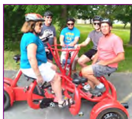
The Lions take a break on the Tandem Bike