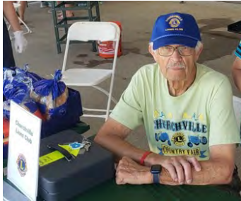
BBQ tickets for sale!

Visitors to the Lions informational table were told the mission of the Lions Club and how they might join. The Lions cooking team served burgers, hot dogs and French fries to the crowd.