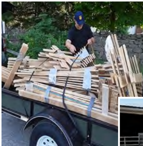
Information and pictures from the Article in the Orleans Hub by Ginny Kropf