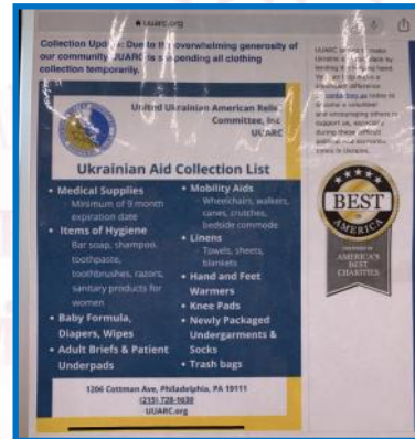
The Avon Grove Lions donated walkers, canes, crutches and bedside commodes to the relief effort for Ukraine. The items came from the Lions Hospital Loaner Program. When the Lions have excess equipment, they try and donate them to organizations that help people in need.