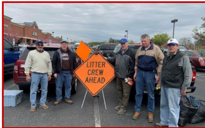
In recognition of Earth Day the Avon Grove Lions conducted a Highway Cleanup along Old Baltimore Pike in the West Grove Pa. area. They collected 19 bags of trash and approximately 40 lbs of other debris.