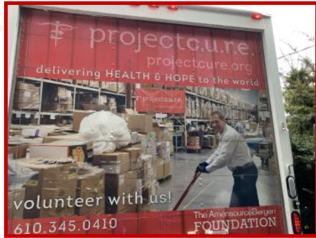
The Avon Grove Lions donated 11 Hospital Beds to Project Cure from their Hospital Program.