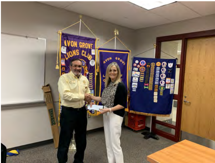
The Avon Grove Lions Presented a check to the Avon Grove Charter School to help with their Night at the Races Fundraiser.