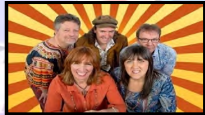
The Large Flowerheads