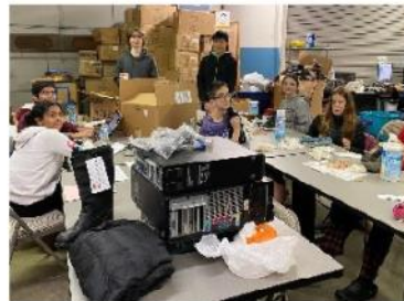
Cataloguing the Inventory