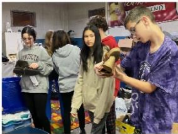
Checking the Donated Shoes