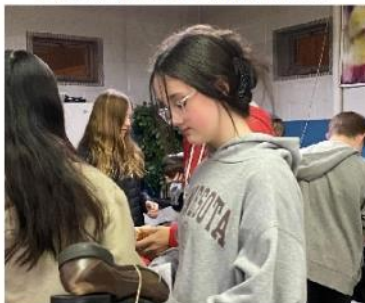
Sizing, Labeling and Arranging