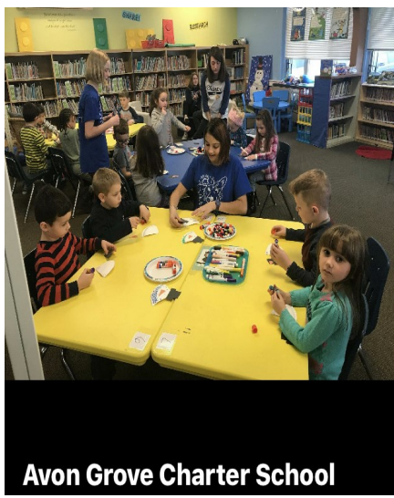
Avon Grove Charter School