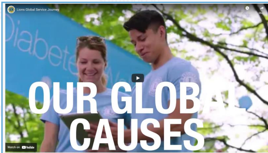
Lions Global Service Journey - YouTube