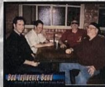
Bad Influence Band