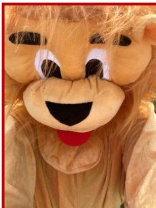
East Fallowfield Park Day- assist the Coatesville Area Lions Club