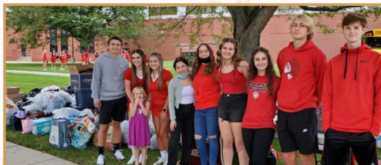
Clothing Collection for Coatesville Flood Victims ^>