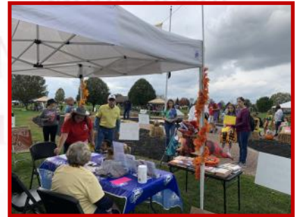
The Avon Grove Lions Conducted Kids Sight, Eye Screenings at Penn Township's Fall Festival. The Lions screened 34 children. Books from the Lions Book Barn along with candy were offered to all children attending. Leos from the Avon Grove High School assisted the Lions.