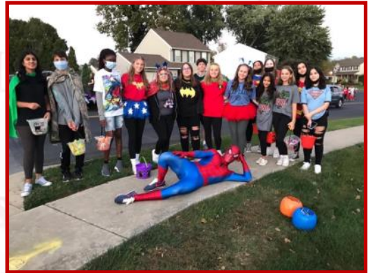
Wilson High School Leo Club, Super Heroes!

What a great group of students. They were so proud to be 2nd in line and carry their banner. They can't wait until next year! A great night of fun at the parade Sponsored by the Spring Township Lions Club. The parade was awesome. Great applause to the Halloween parade committee . You did an awesome job. Everyone was having fun. A lot of work and preparation was put into this parade!