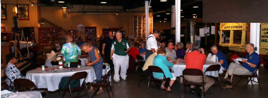
Various scenes from Passing of the Banner