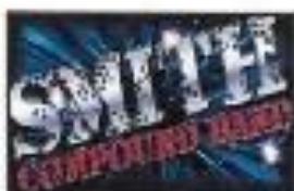
Smith Compound Band