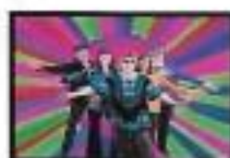
The Large Flowerheads