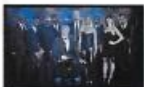
The Uptown Band

Rain or shine. Bring your chair or blanket. E-Z up canopies allowed, but only on perimeter of grounds.