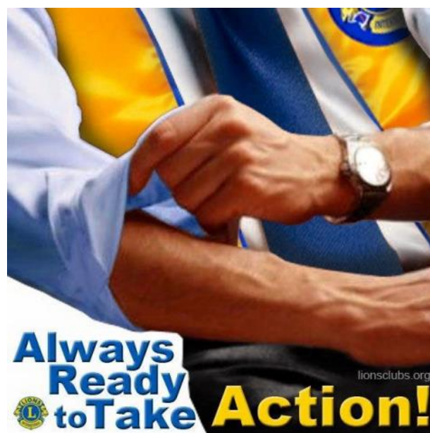
International Convention Club Delegate Entitlement Table